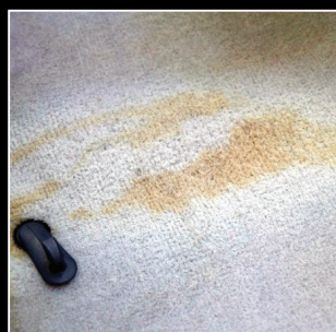
Interior Surface Stains