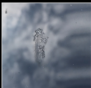
Bat Droppings Stains